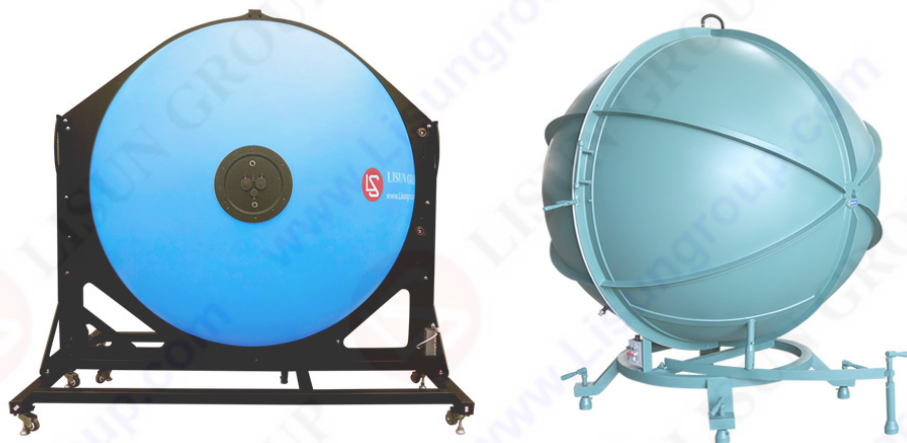
A Molding Integrating Sphere VS the traditional Integrating Sphere

Due to the LED luminaries such as LED street luminaries developed, to do 4π geometry testing, it is hard to be hold in the traditional integrating sphere design. To solve this problem, LISUN design a new kind of sphere.